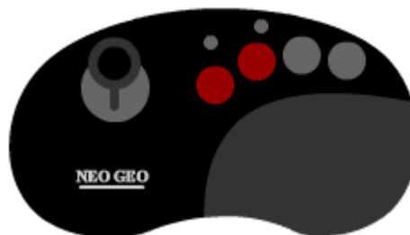
Neo Geo CD Controller Pro

The Neotap doesn't guarantee compatibility with the gamepad Neo Geo CD Controller . The Neotap doesn't guarantee compatibility with third-party peripheral devices.