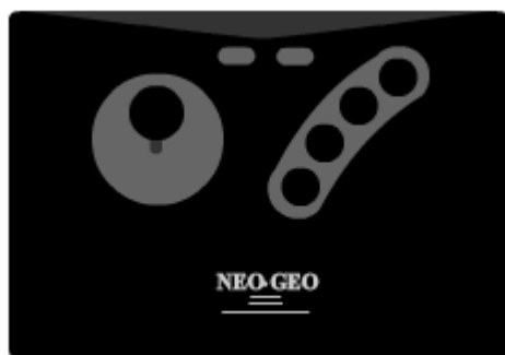
stick Neo Geo Arcade

The Neotap is compatible with sticks Neo Geo Arcade and Neo Geo CD Controller Pro .